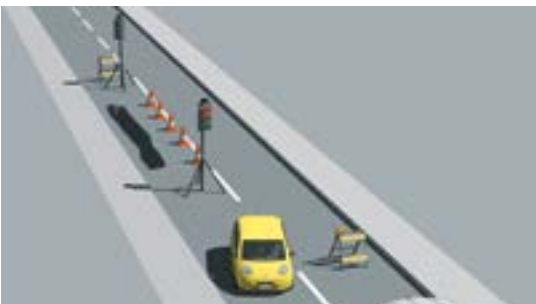
Temporary traffic control